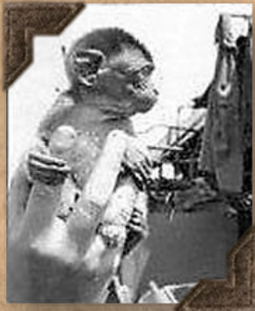
PT 187 Eight Ball

PTer's sometimes adopted pets as boat mascots, dogs seemed a favorite but there were other critters too including monkeys. Examples include "Eight Ball" the monkey aboard PT 187, which was also the name given to the boat. "Hatches" the dog was aboard PT 373.