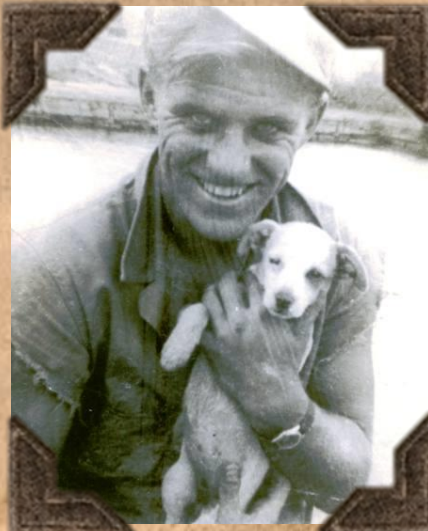
209 with Mascot Umbriaggio