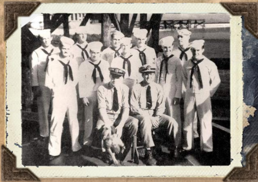
346 Crew Chopper the Irish terrier