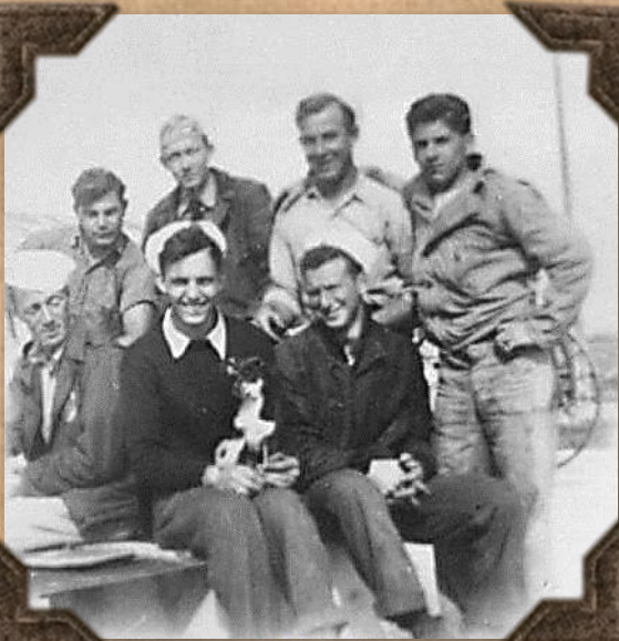
309 Crew with Mascot Frankie