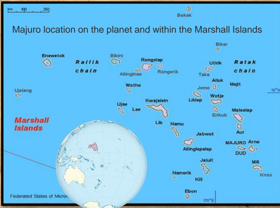
Majuro location on the planet and within the Marshall Islands