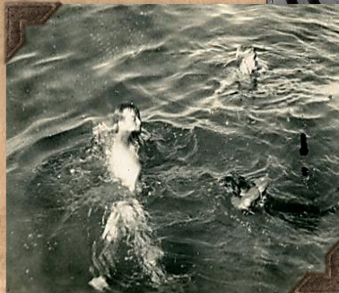
PT 373 pet and mascot "Hatches" in lifejacket swimming with crew