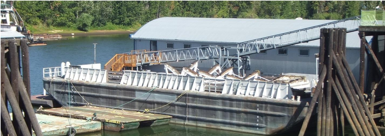
Note the Boat cradle on the barge – the only remaining original PT boat cradle