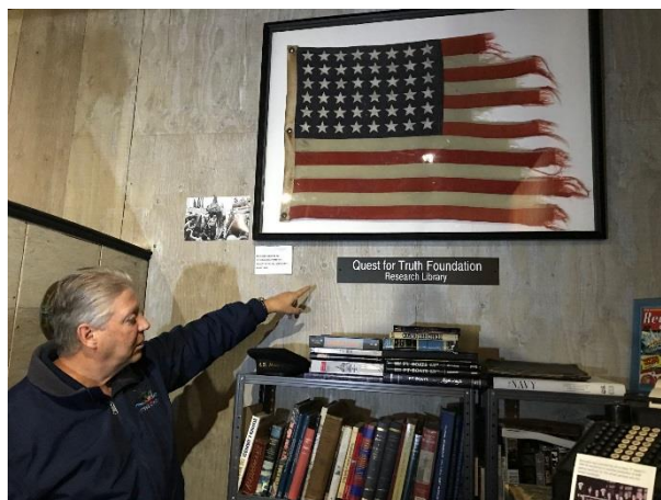
THANK YOU! Quest For Truth

The space also includes a small theater with a large TV screen to watch videos, movies such as "They Were Expendable", documentary films and slide presentations. The office area includes files containing a variety of original PT Boat related documents. The Research Library is named for the Quest for Truth Foundation , one of our cherished donors. Each area has been designed to change over time with new artifacts and displays.