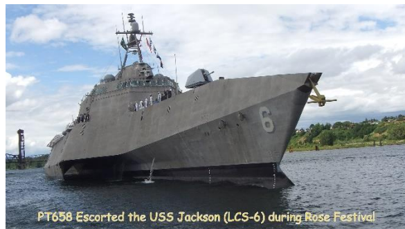
PT658 Escorting the USS Jackson (LCS-6) during Rose Festival