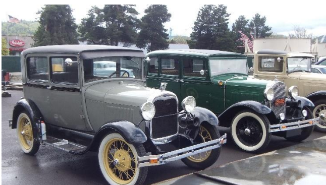
Sometimes a tour is as much fun for us as for them