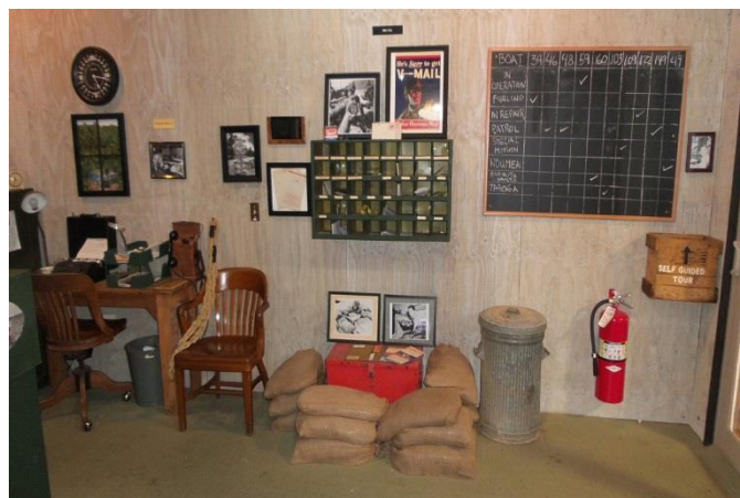
Replica of PT squadron base with boat status board

PT 658's new museum continues to evolve with exciting exhibits and collections! Exhibits include presentations on V-mail, a base office, armament, bases of PT operations, daily life of PT crews with card game, a PT Boater biography, PT engines, famous PT boats and crews, PT 658 restoration, Pearl Harbor, Higgins and Walt Disney. Exhibits display many original WW II era artifacts which have been generously donated by individuals and family members. Four of the exhibits feature flat screen TVs showing photos and videos.