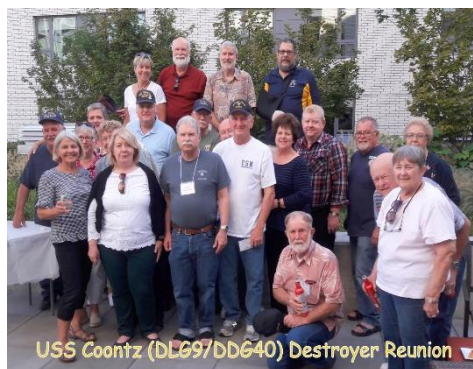
USS Coontz (DLG9/DB640) Destroyer Reunion