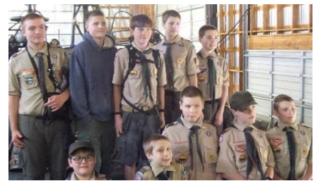
Sea Scouts (future PT 658 Volunteers??)