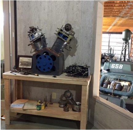
Packard Engine Cut-A-Way display

displays. A new HVAC system and insulation are providing a museum-quality environment to protect and view artifacts and exhibits in comfort.