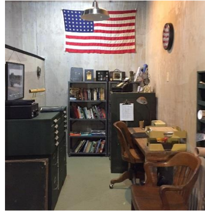
Typical 1940's office setup

Display cabinets are being built to showcase and protect artifacts, and the archive and research space contains files and flat map cabinets, along with a desk, chair, clock, fan, radio and other period artifacts. Bookshelves will hold a variety of books. The "Mail Call" exhibit features a letter sorter which holds copies of authentic WWII letters from the warfront and home front. Artifacts will be used for various exhibits featuring engines, weapons, bases of operations, daily crew life, PT 109, the "Plywood Derby", PT 658 before and after restoration, etc. The storage closet adjacent to the archive/research space will store additional artifacts and supplies for exhibits. Plans include seating, storage areas, a gift shop, and a WWII/PT Boat timeline along the internal walkway from the museum space.