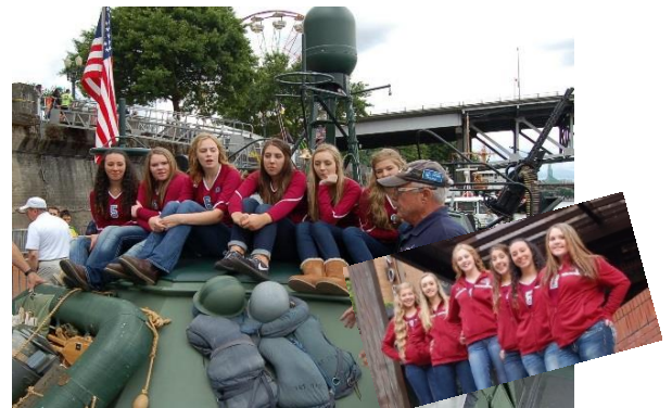
Stevenson, WA Girls HS Volleyball Team