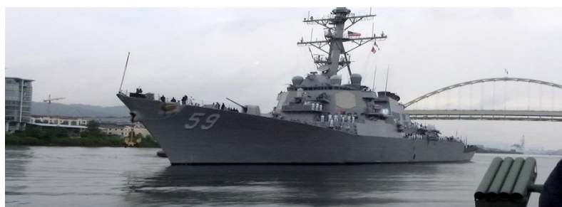
PT 658 escorts the USS Russell into port during Rose Festival 2016