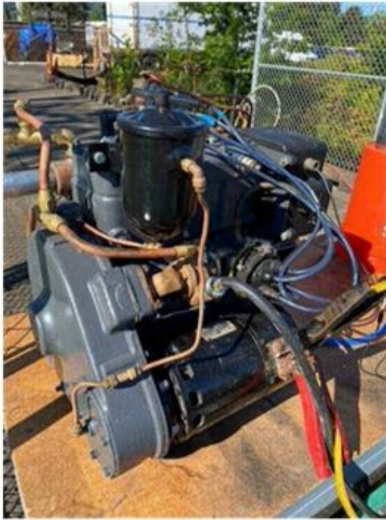
Completed Waukesha Model ICK engine with Eclipse Starter/Generator ready for test run (left). Sherwood pedestal mounted pump (below).

To date, we have not been able to locate the correct Higgins pump. However, we have an equivalent pedestal mounted belt driven gear pump from the period manufactured by the Sherwood Brass Works, of Detroit, MI. During the winter of 2021, we will attempt to adapt the Sherwood pump for installation.